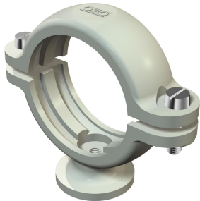
ISO base clip 9–11 mm